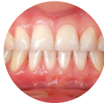
Healthy teeth & gums