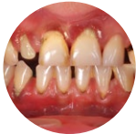
Diseased & infected gums