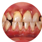
Diseased & infected gums