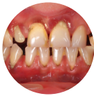
Diseased & infected gums